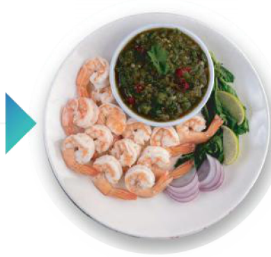
35 pcs Prawn