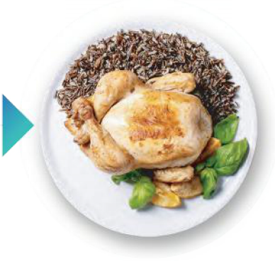
1 Whole Chicken