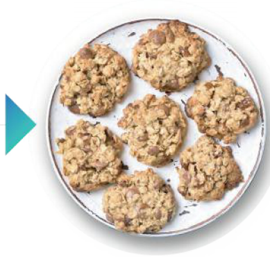
40 pcs Cookies