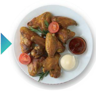
32 pcs Wings